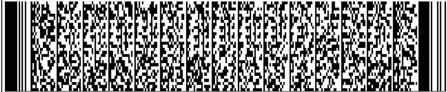
Scannable Bar Code