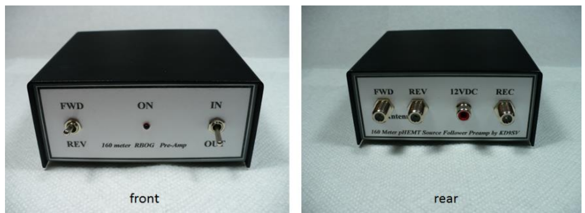
Figure 1 – Control Box

The KD9SV RBOG consists of a feed transformer, a reflection transformer, two-conductor wire and a control box. For two-direction performance, you need to provide two RG-6 coax feed lines that run from the feed transformer at the antenna to the control box in the shack. The control box (see Figure 1) includes a 160-Meter band pass filter, a 20 dB preamp and a termination for the coax on the unused direction. The preamp and filter are bypassed for operation on frequencies higher than 1.8 MHz. A 12 VDC source is also needed for the control box.