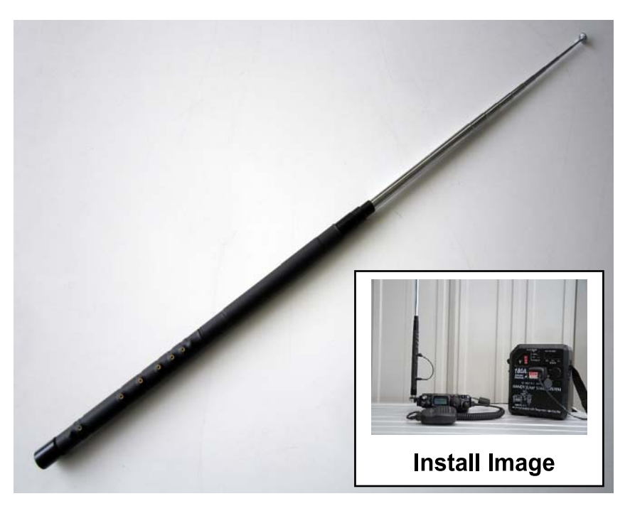
This antenna is recommended to use counterpoise and antenna tuner.