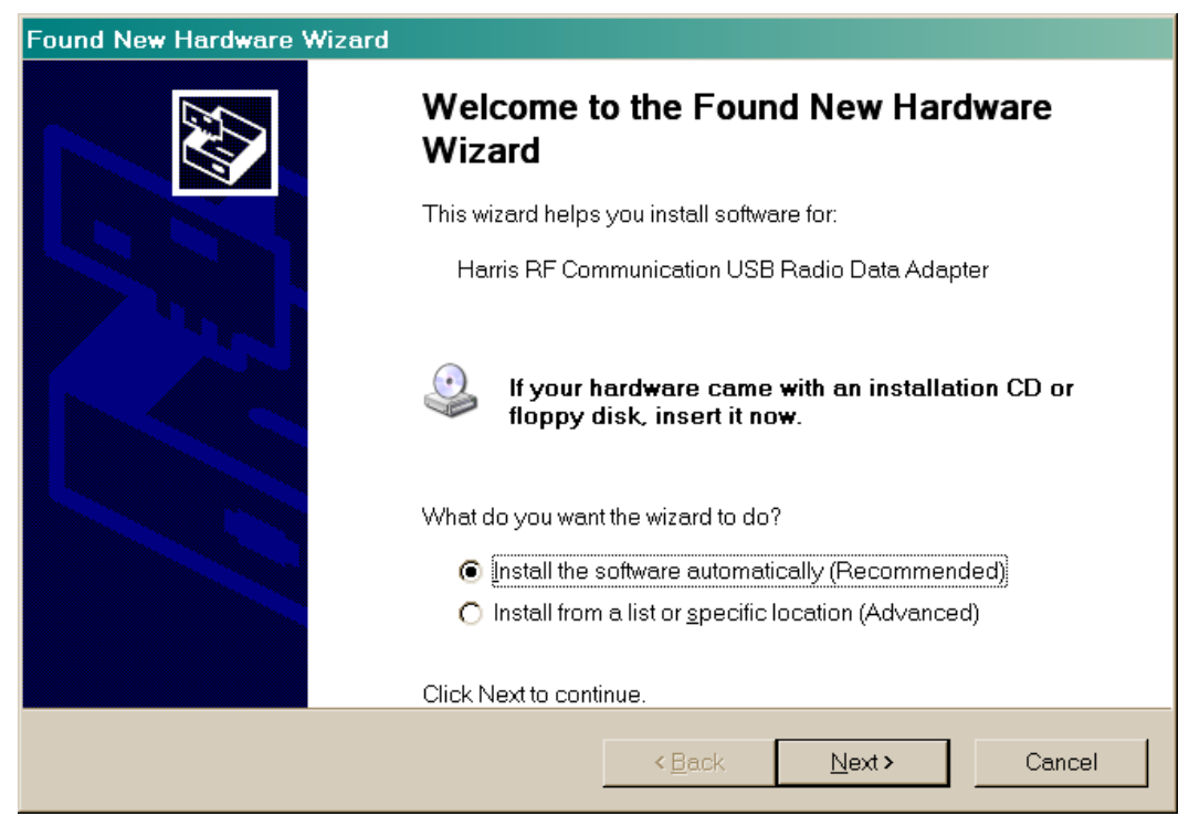
Figure 1-7 URDA Device Driver Installation Wizard Screen