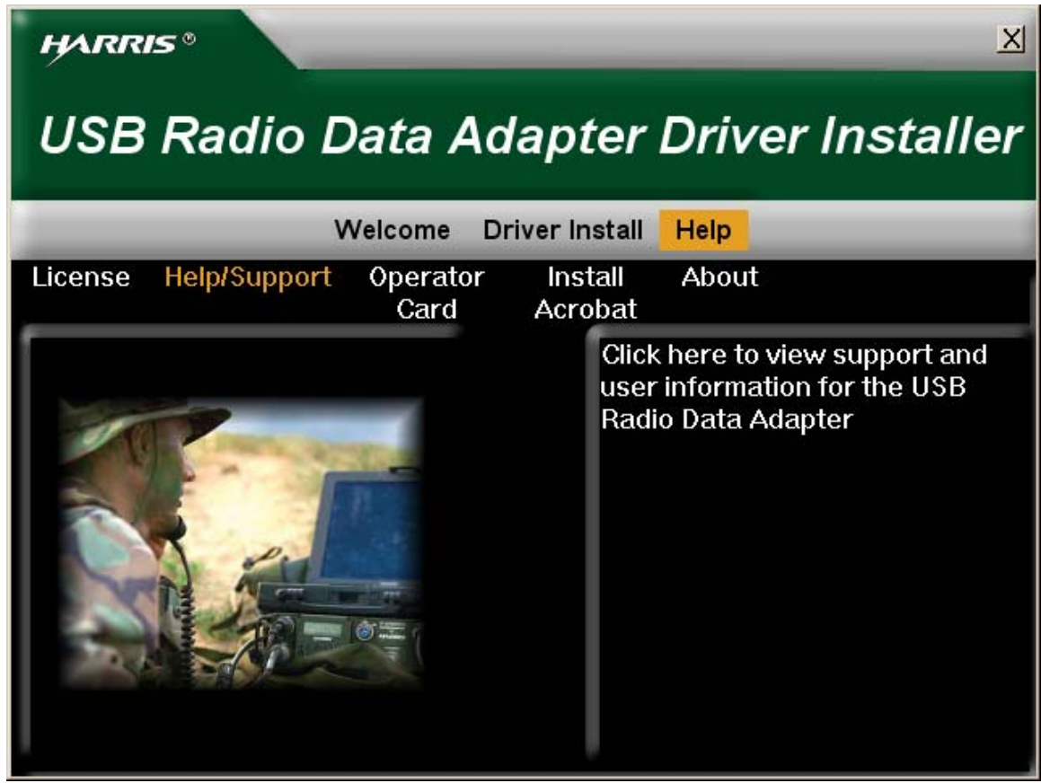
Figure 1-2 Access URDA Help