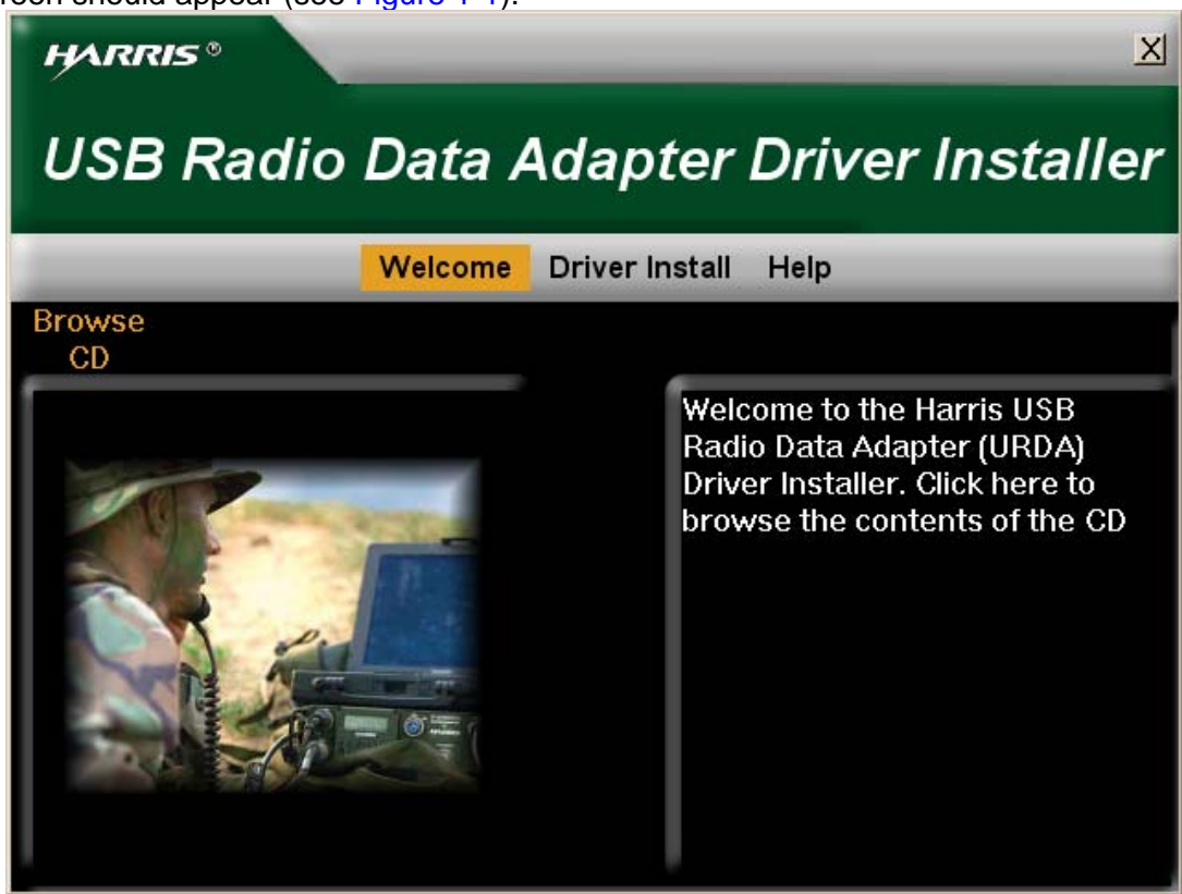
Figure 1-1 URDA Installer Welcome Screen

To display information on the CD and perform the URDA driver installation, turn on the computer and insert the URDA CD into a CD driver. URDA Driver Installer welcome screen should appear (see Figure 1-1).