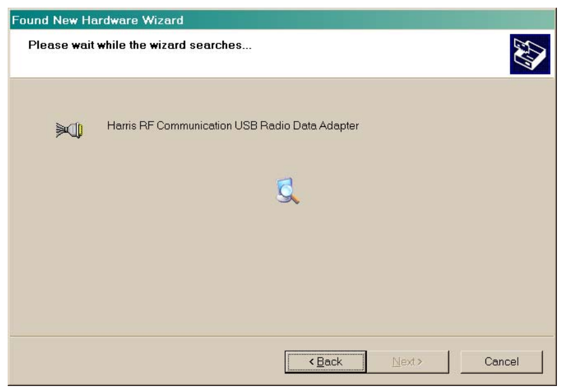
Figure 1-8 URDA Device Driver Installation Search Screen

9. The URDA device and radio are now ready for use.