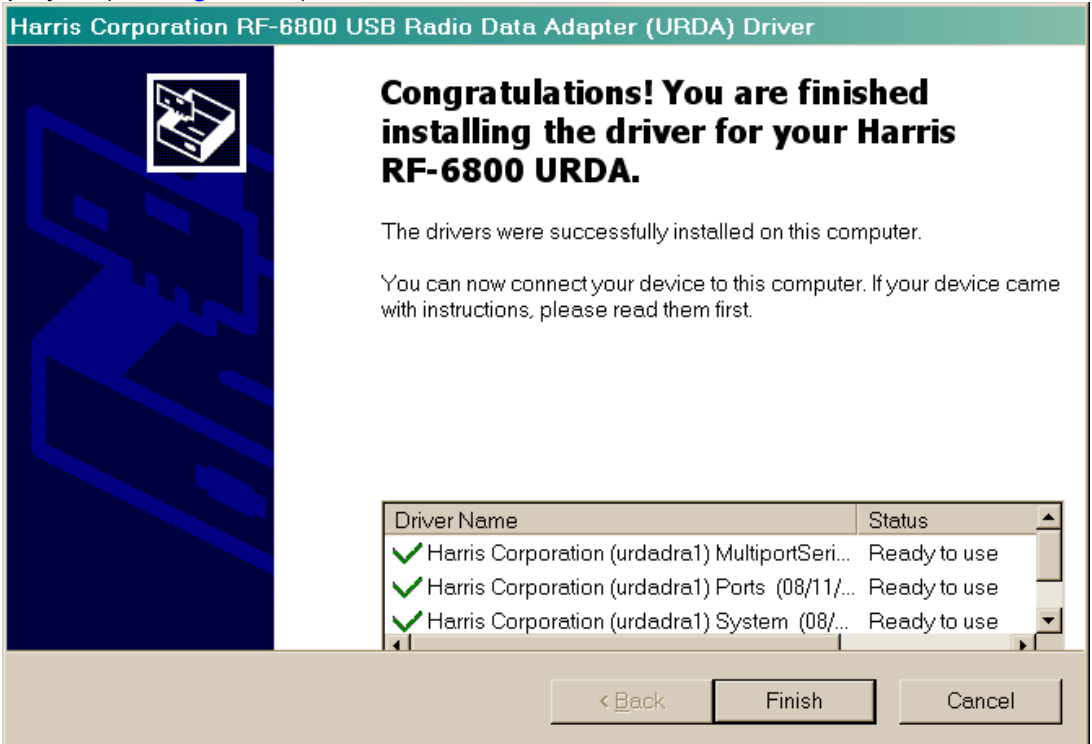
Figure 1-6 URDA Installation Complete Screen

5. Following the successful installation the URDA Driver, the screen shown below will be displayed (see Figure 1-6).