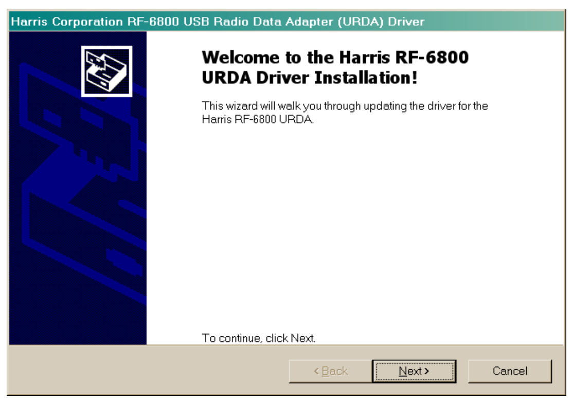
Figure 1-3 URDA Installation Wizard Screen

3. Click Next to proceed with the driver installation. The next screen presented allows the user to accept or decline the end user license agreement (see Figure 1-4). This screen also allows the user to save a copy or print a copy of the EULA.